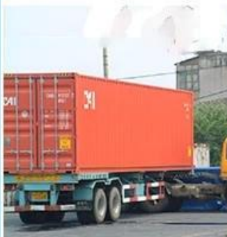
BY 20GP CONTAINER