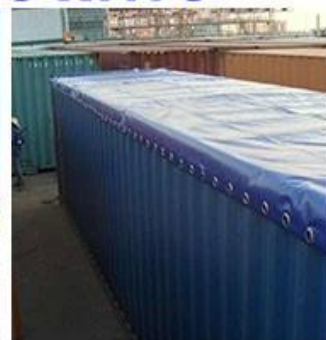
BY 40 OT CONTAINER