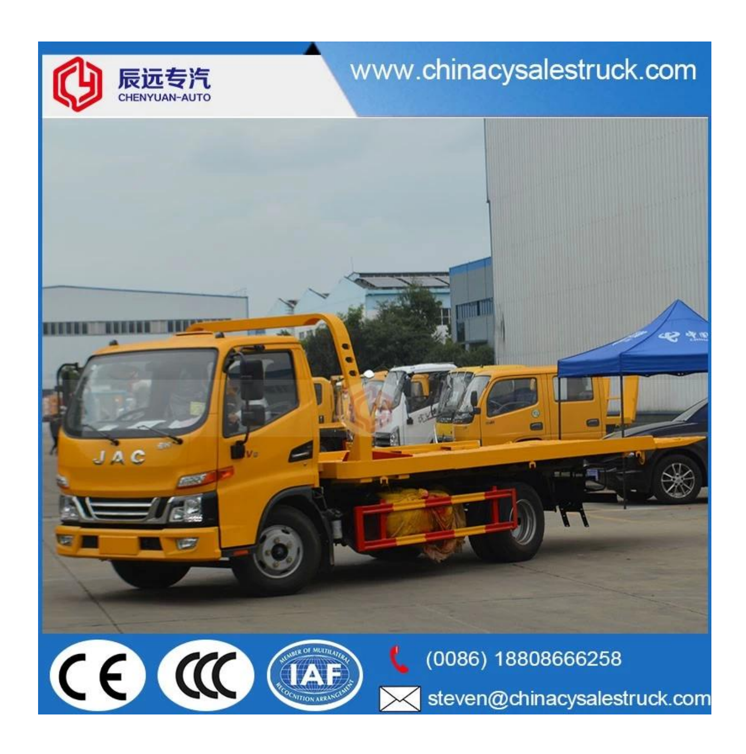
JAC 6 Tons tow truck manufacture in china