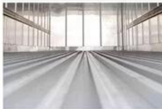
T-type air-ducting bottom rail patterned aluminum sheet