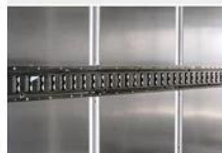
Stainless steel tamper-resistant board