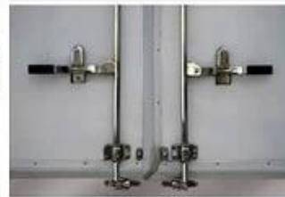
Stainless steel door lock mechanism