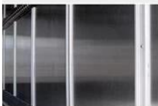
Side vertical air-ducting groove