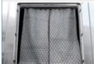
Rear door heat insulating curtain