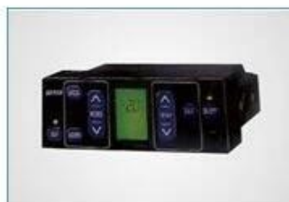
LCD control panel