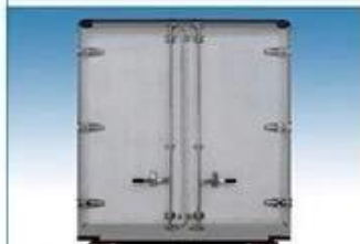
Stainless steel door frame