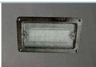
LED cold light lamp