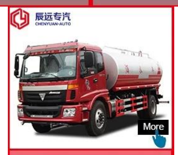
Hubei ChenYuan Special Auto Co., LTD

DONGFENG BRAND OLD STYLE Overall dimension(mm):9950X2490X3350 Tank volume (m³): 20000 Liters