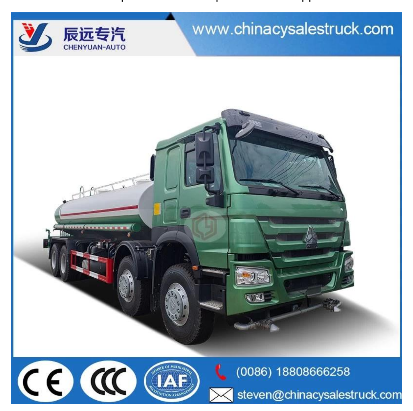
HOWO 20cbm transport water tank sprinkle truck supplier in China