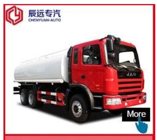
Hubei ChenYuan Special Auto Co., LTD