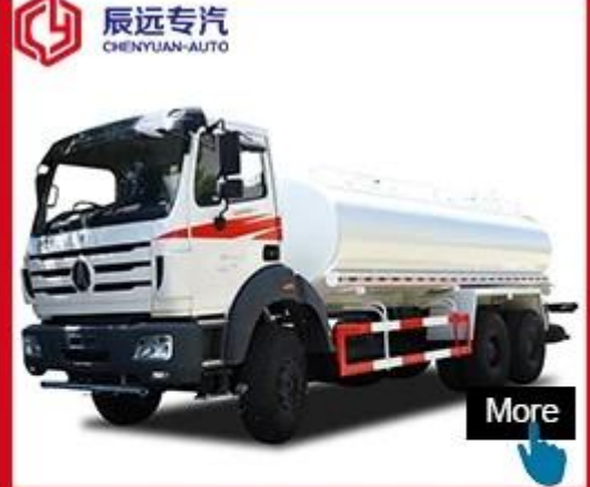
Hubei ChenYuan Special Auto Co., LTD