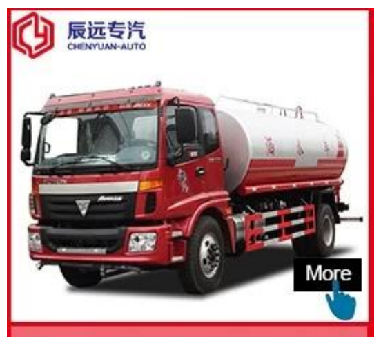
Hubei ChenYuan Special Auto Co., LTD