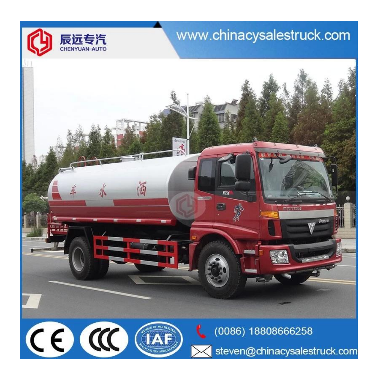
Foton 12000 liters water truck tank delivery price