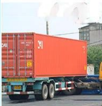
BY 20GP CONTAINER