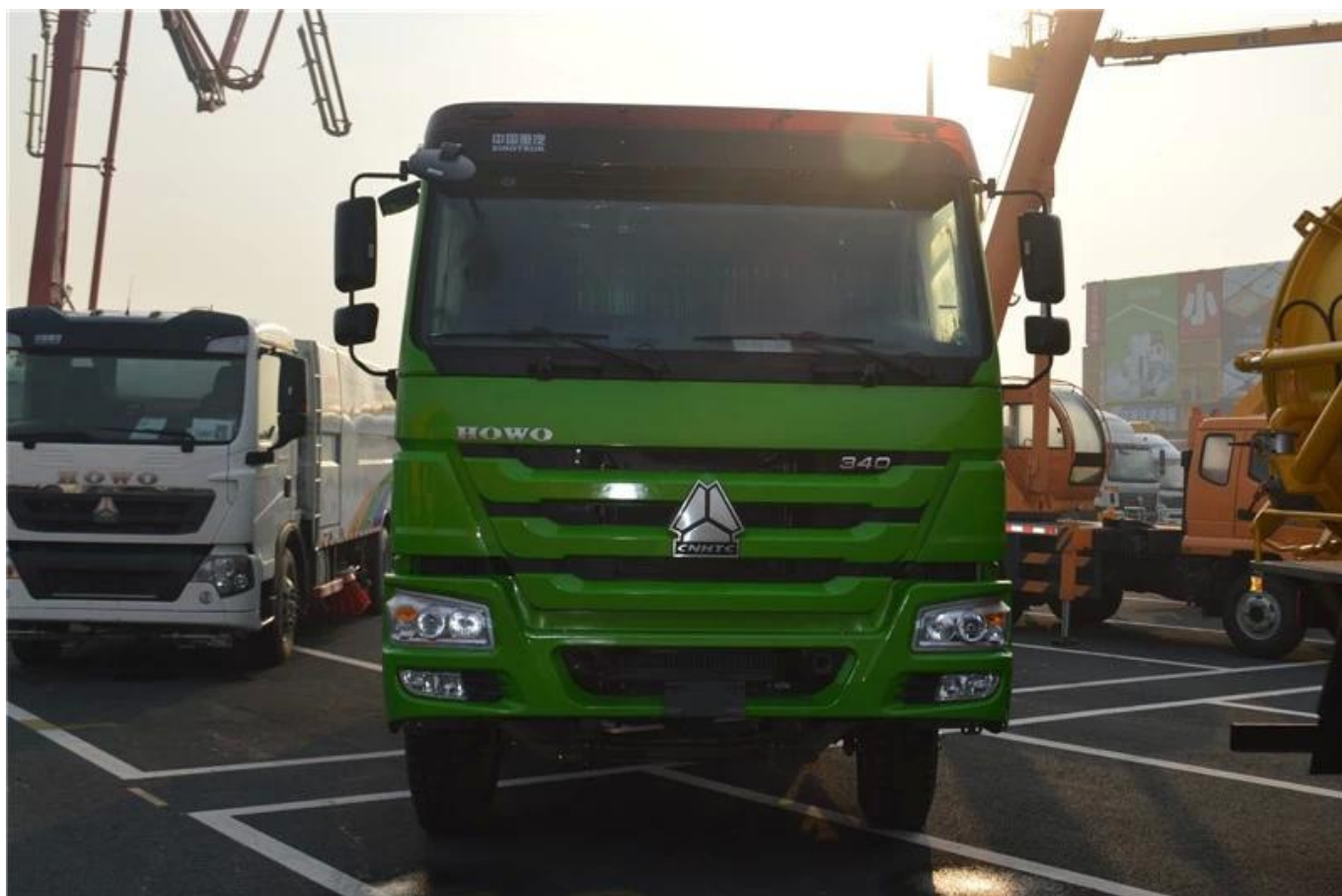
HOWO 6x4 china dump truck for sale in dubai