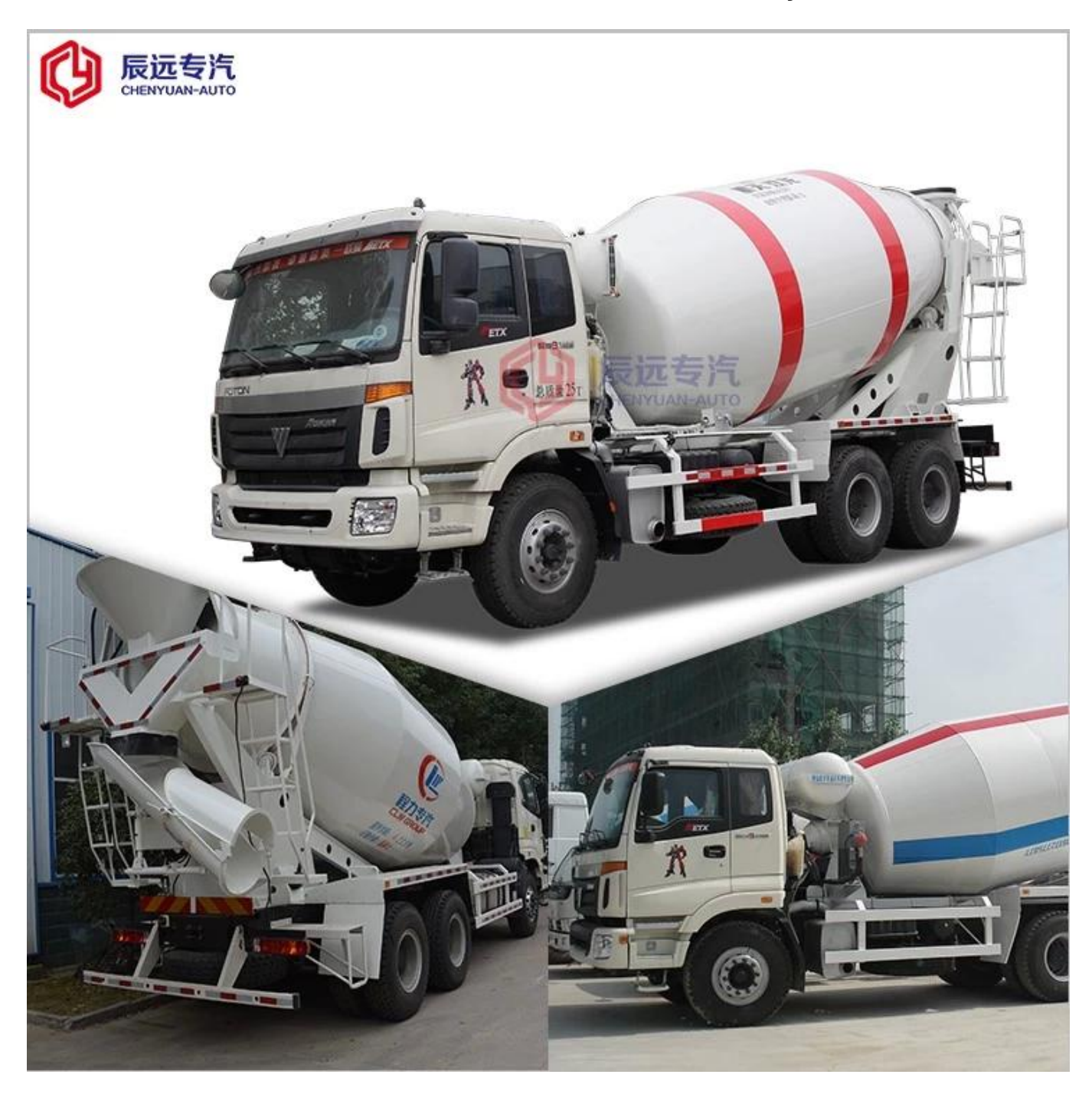
Foton 8-12m3 concrete cement mixer truck in Malaysia