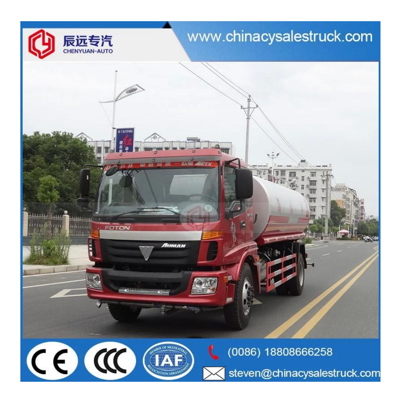
Foton 4x2 water tanker truck price in india