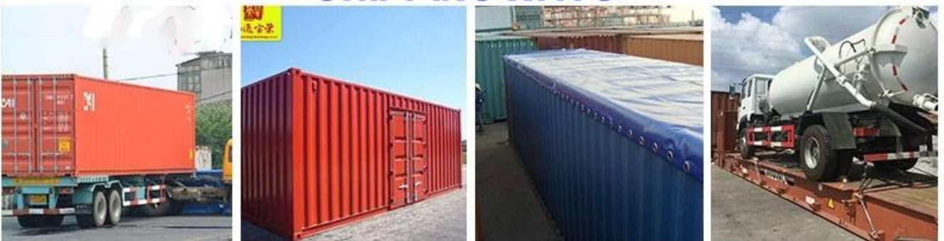
BY 20GP CONTAINER