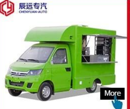
Hubei ChenYuan Special Auto Co., LTD

Foton Brand mobile food truck Overall dimensions(mm): 4730×1780×2630 Cabinet size(mm):2900*1720*1810