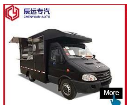
Hubei ChenYuan Special Auto Co., LTD

CHANGAN Brand mobile food truck Overall dimensions(mm): 4730×1780×2630 Cabinet size(mm):2900*1720*1810