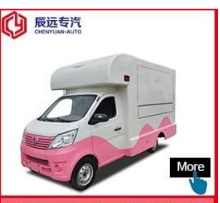
Hubei ChenYuan Special Auto Co., LTD

CHERRY Brand mobile food truck Overall dimensions(mm): 4730×1780×2630 Cabinet size(mm):2900*1720*1810