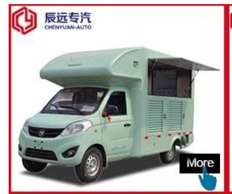
Hubei ChenYuan Special Auto Co., LTD

Foton Brand mobile food truck Overall dimensions(mm): 4730×1780×2630 Cabinet size(mm):2900*1720*1810