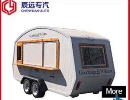
Hubei ChenYuan Special Auto Co., LTD

NECO Brand mobile food truck Overall dimensions(mm): 5995x2370x3200 Cabinet size(mm):3650x2120x1960