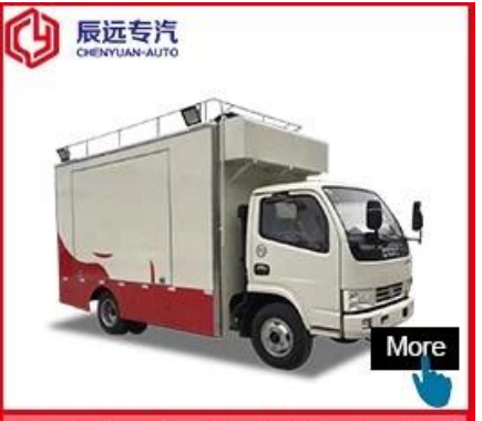
Hubei ChenYuan Special Auto Co., LTD

FOOD TRAILER Overall dimensions(mm): 5630*2130*2500